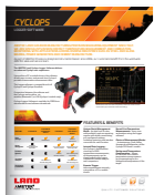
CYCLOPS LOGGER SOFTWARE

SEE OUR OTHER RELATED LITERATURE FOR THE CYCLOPS L: