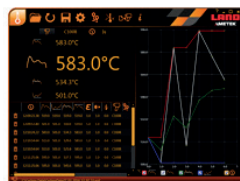
The Table View showing Instantaneous, Valley, Average and Peak, plus the unique Meltmaster temperature (on the 055 L model) readings.

The Trend View displays Peak, Instantaneous, Average and Valley temperatures, Logger settings, Route Manager, Background Correction plus Timed Logging (taking measurements at pre-defined intervals between 1 and 60 secs).